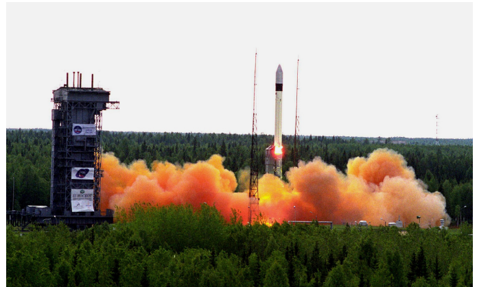
Fig. I.4.2. The launch of MOST on 30 June 2003, aboard a Russian Rockot from the Plesetsk Cosmodrome.